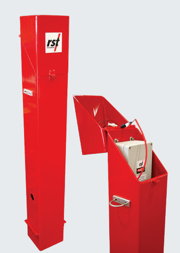
A data logger housed in a Square Lockable Enclosure (available for EP1311B only).