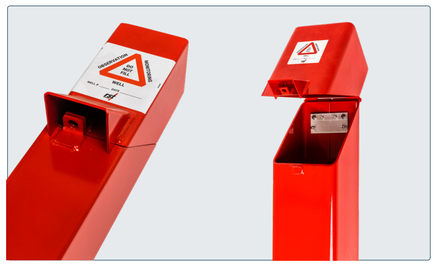
Square Lockable Enclosure (EP1311B).