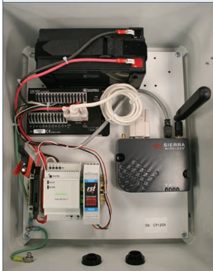
CR300 FlexDAQ Data Logger shown with optional cellular modem for data communication.

READY TO RUN pre-assembled pre-wired pre-tested pre-programmed