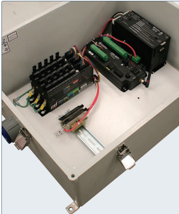
CR6 FlexDAQ Data Logger (with optional wi-fi) in a weatherproof enclosure with RST Flexi-Mux Multiplexers.