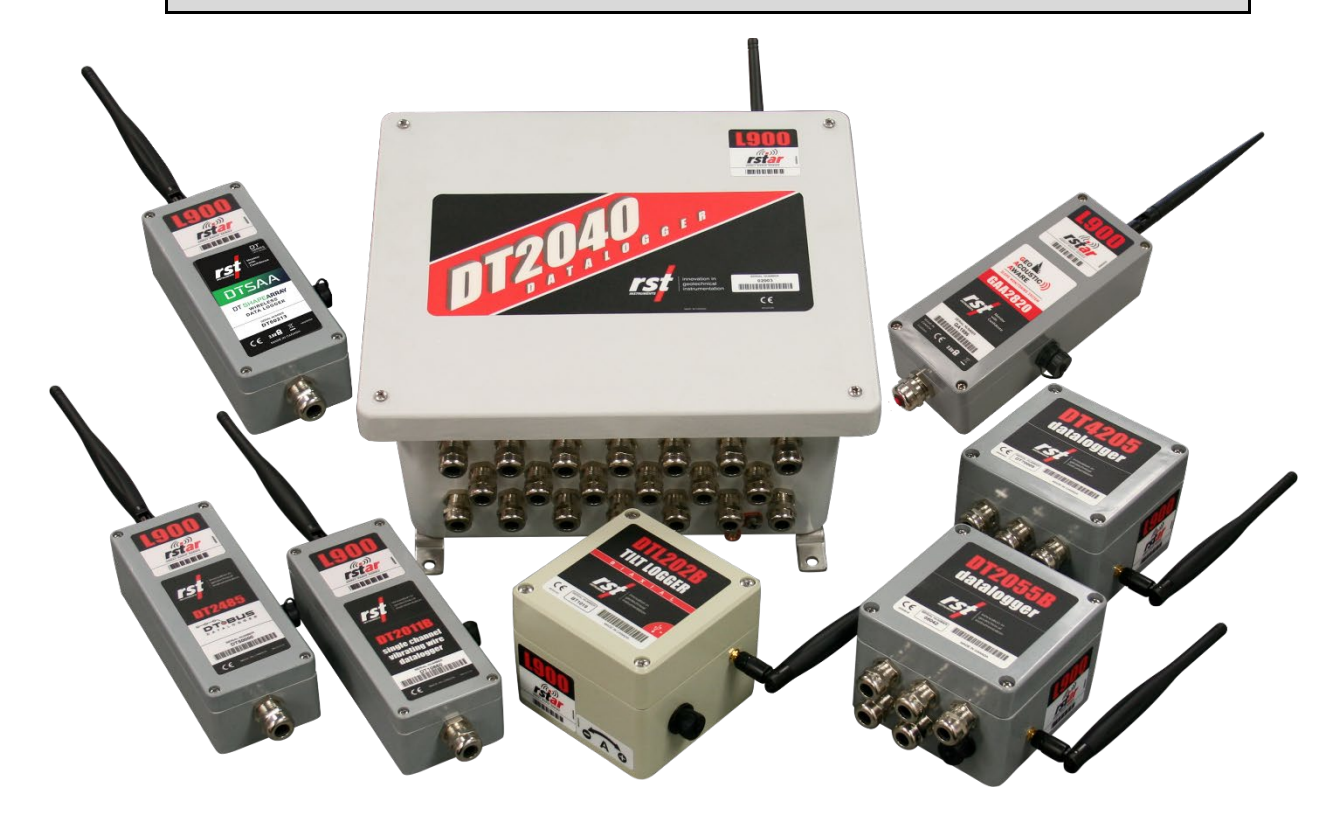
FIGURE 1-1 RST INSTRUMENTS DT SERIES DATALOGGERS

DT LOGGERS ARE RAIN-TIGHT BUT CANNOT BE SUBMERGED.