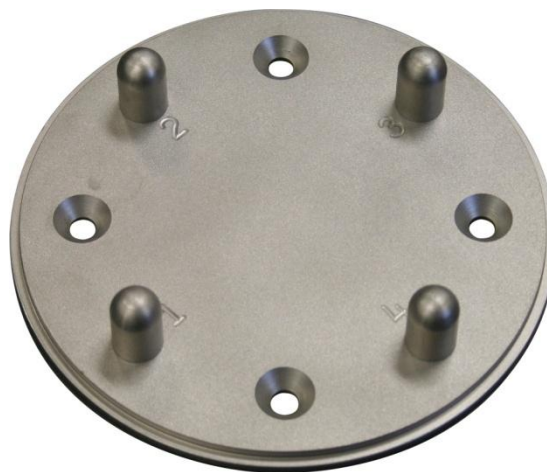
Figure 2: Tilt Monument Plate

The Tiltmeter Monument may be attached to existing concrete using mechanical fasteners, using grout, or a combination of methods. Mechanical fasteners require precise concrete drilling and/or a central adapter plate. The effectiveness of grouts, either cement-type or chemical, is highly dependent on the concrete condition, surface preparation, site conditions and other variables.