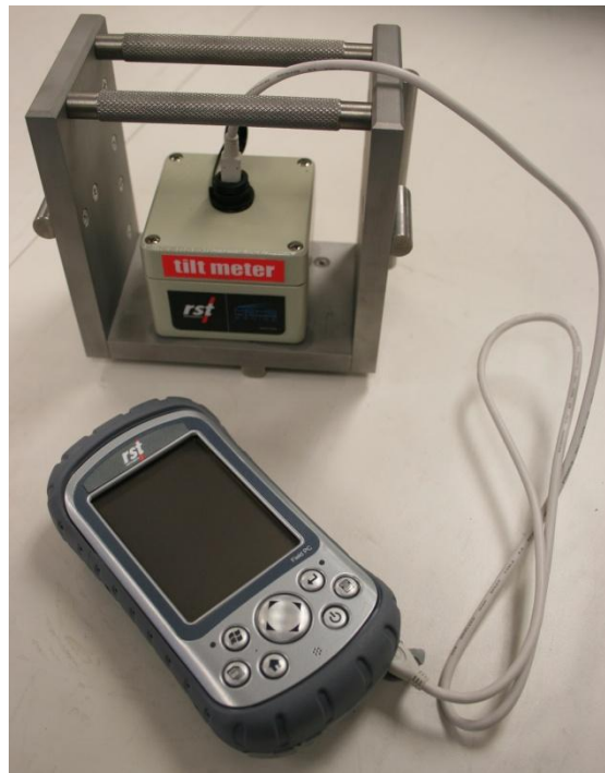
Figure 1: MEMS Portable Tiltmeter & MEMS Portable Tiltmeter Readout

The Tiltmeter is typically read via a field PC. All Readouts are configured to display the data in engineering units of (sine \theta ).