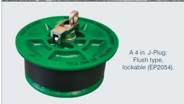
A 4 in. J-Plug: Flush type, lockable (EP2054).