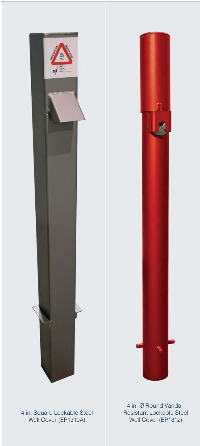
4 in. Square Lockable Steel Well Cover (EP1310A)