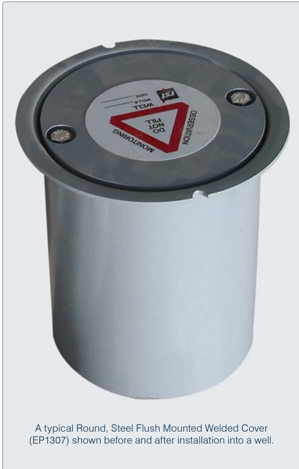
A typical Round, Steel Flush Mounted Welded Cover (EP1307) shown before and after installation into a well.